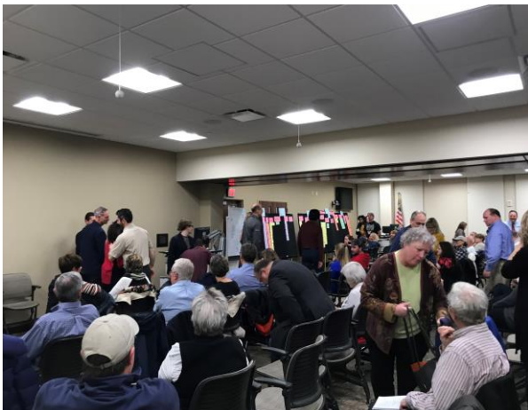
City leaders, residents, and business owners brainstorming during the strategic planning session