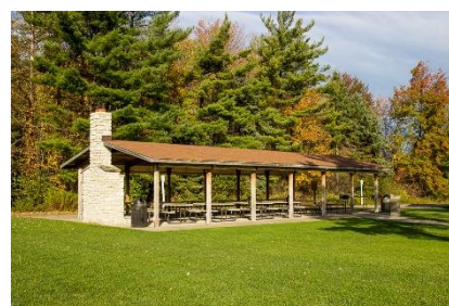
Outside Pavilion Features charcoal grills, 12 picnic tables (up to 80 people), a fireplace and bocce ball courts

Anniversary Parties Birthday Parties Baby Showers Bridal Showers Graduation Parties Family Reunions