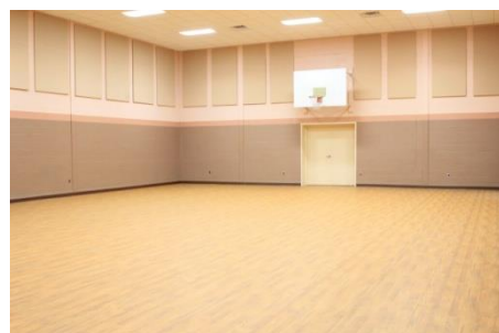
Gym Accommodates up to 120 seated

Our indoor rooms and outdoor pavilion can accommodate your next party!