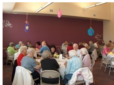
Violet Field Room Accommodates up to 60 seated