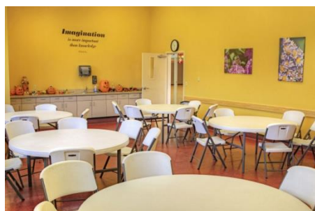
Sunflower Meadow Room Accommodates up to 48 seated

Looking for the perfect place to host your next party?