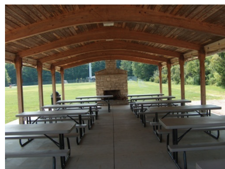
Outside Pavilion Features charcoal grills, 12 picnic tables (up to 80 people), a fireplace and bocce ball courts

Anniversary Parties Birthday Parties Baby Showers Bridal Showers Graduation Parties Family Reunions Retirement Parties