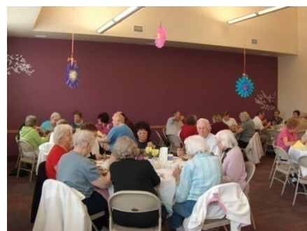
Violet Field Room Accommodates up to 60 seated