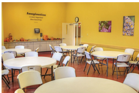
Sunflower Meadow Room Accommodates up to 48 seated

Looking for the perfect place to host your next party?